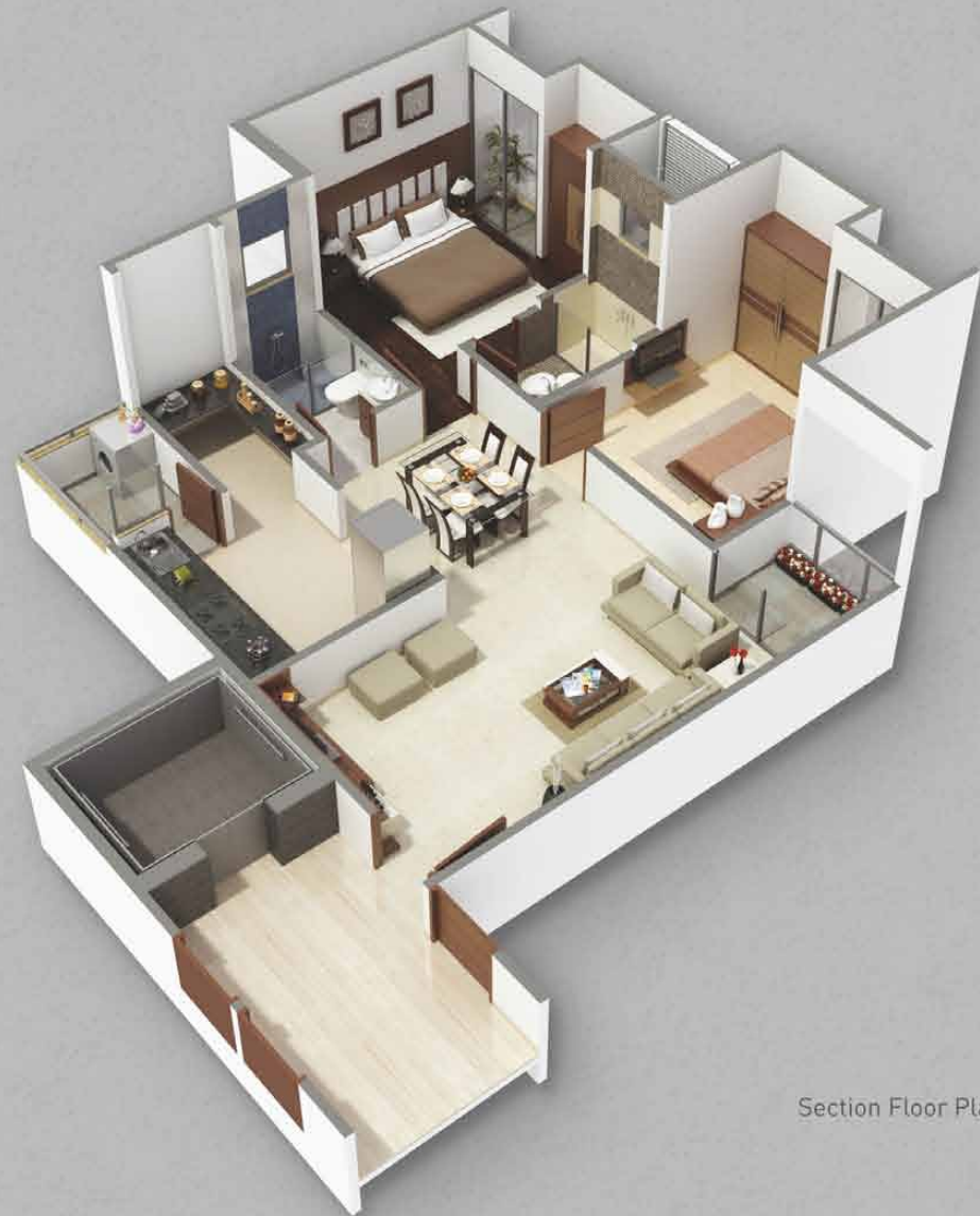
Section Floor Plan