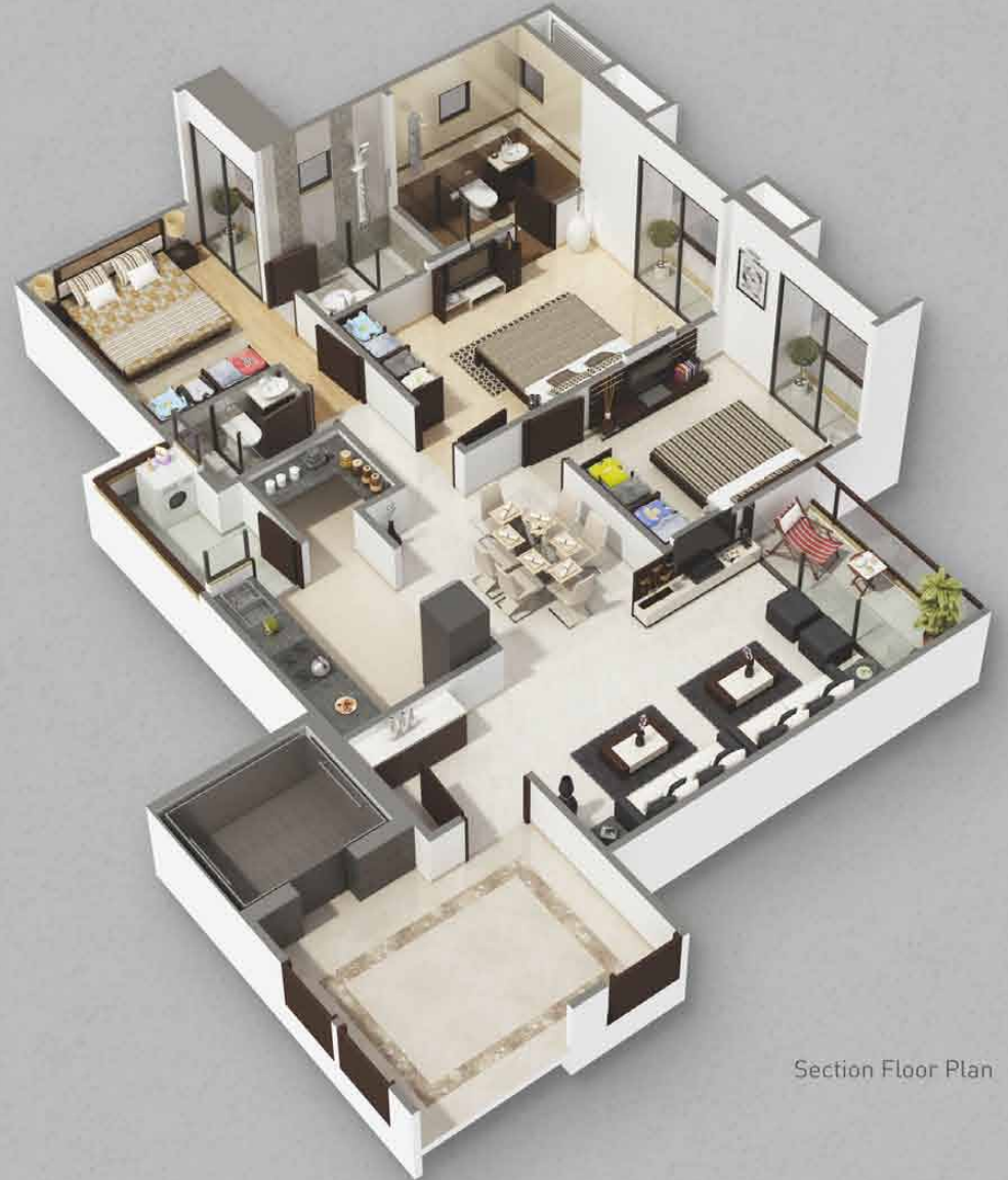
Section Floor Plan