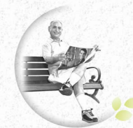
Senior Citizen Area

From spacious designer homes to landscaped gardens, from accessories adorning the premises to rich facility spaces; everything at Nysa Courtyard exemplifies a deep sense of aesthetics and style to leave a lasting impression on the beholders.